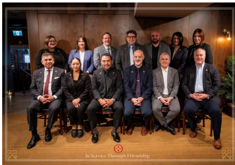
Canadian National Board :

In 3 years, we will be celebrating our milestone 50th Anniversary and we look forward to celebrating with you all. Please watch our website for updates. www.lesclefsdorcanada.org