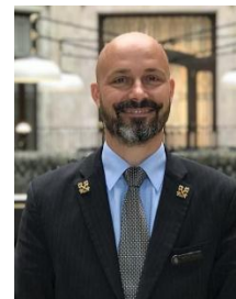
Peter Buday Four Season Hotel, Gresham Palace Budapest HUNGARY