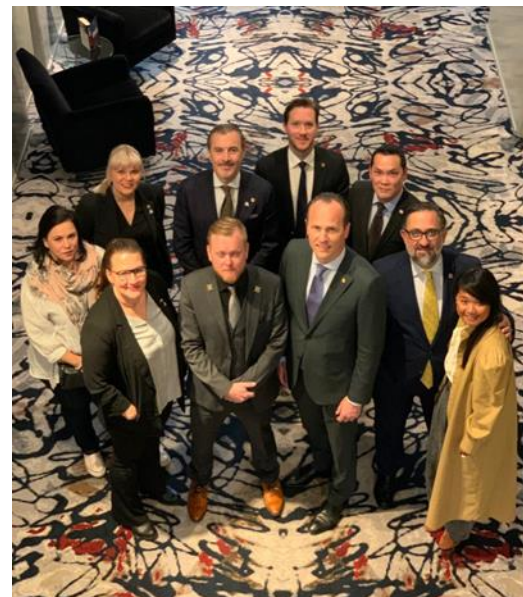
In Helsinki, Finland, with the Scandinavian Zone Leaders