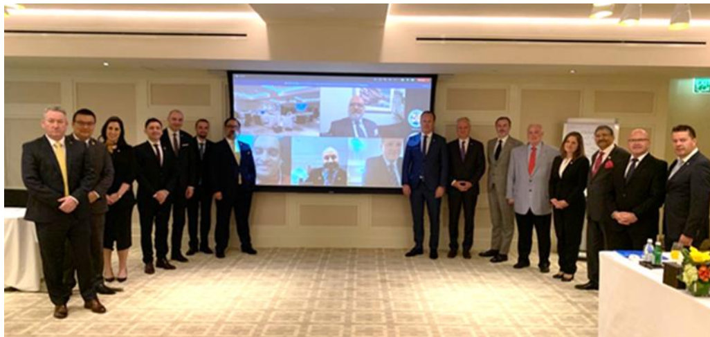
UICH International Leadership meeting in Doha, Qatar – our first face-to-face meeting in 18 months!